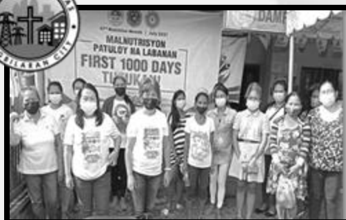
BRGY. DAMPAS , Tagbilaran City DIMENSION 1 & 4