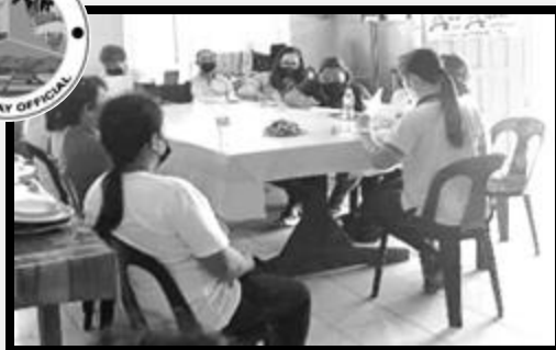
BRGY. UBOJAN , Sagbayan, Bohol DIMENSION 2 & 3