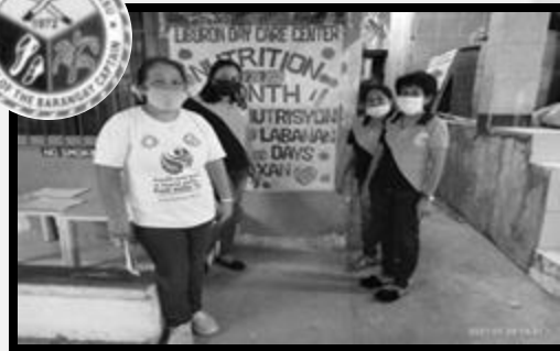
BRGY. LIBURON , Carcar City DIMENSION 1