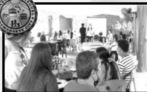
BRGY. BATINGUEL , Dumaguete City DIMENSION 5