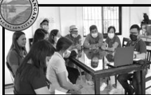
BRGY. LINOZHANGAN , Canlaon City DIMENSION 3