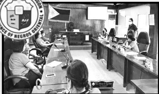
AYUNGON, Negros Oriental DIMENSION 1