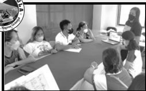
BRGY. PULA , Canlaon City DIMENSION 2