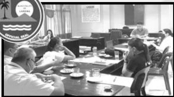
LARENA, Siquijor DIMENSION 3