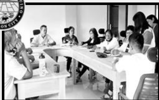
BRGY. NINOY AQUINO , Canlaon City DIMENSION 3