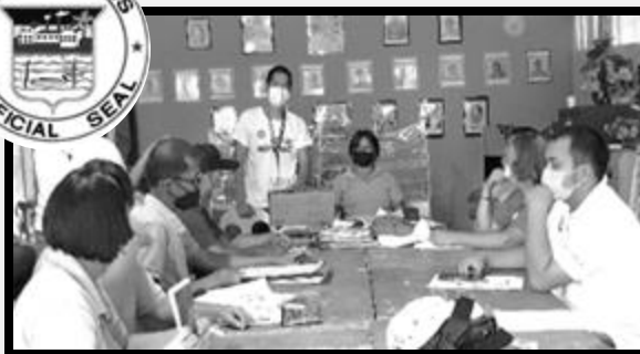
BAIS CITY, Negros Oriental DIMENSION 3