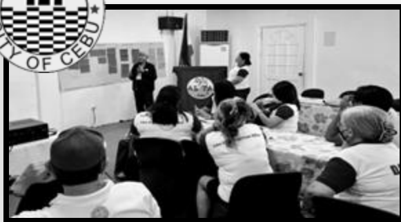
CEBU CITY, Cebu DIMENSION 3