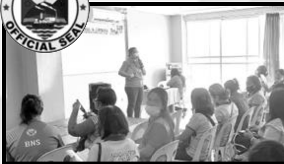
DANAO CITY, Cebu DIMENSION 2

BEST LGU per dimension of the MELLPI Pro