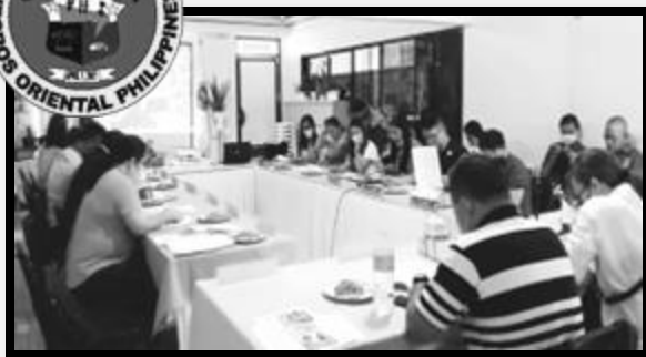
TANJAY CITY, Negros Oriental DIMENSION 3