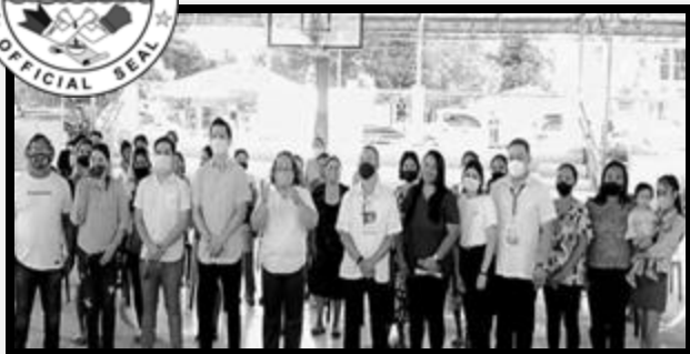
TAGBILARAN CITY, Bohol DIMENSION 2, 3 & 4