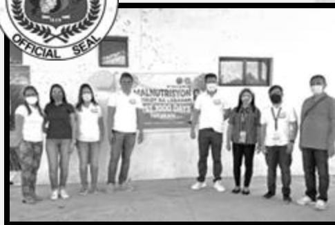
CANLAON CITY, Negros Oriental DIMENSION 2 & 3