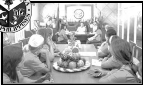
CITY OF NAGA, Cebu DIMENSION 1