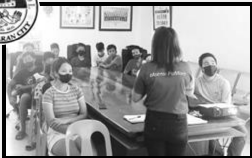
BRGY. BOOL , Tagbilaran City DIMENSION 1, 2 & 4