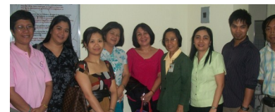
L-R: WHO/NCHP, FAO, NNC, NNC6, St. Paul Hospital, DOLE R6, UNICEF