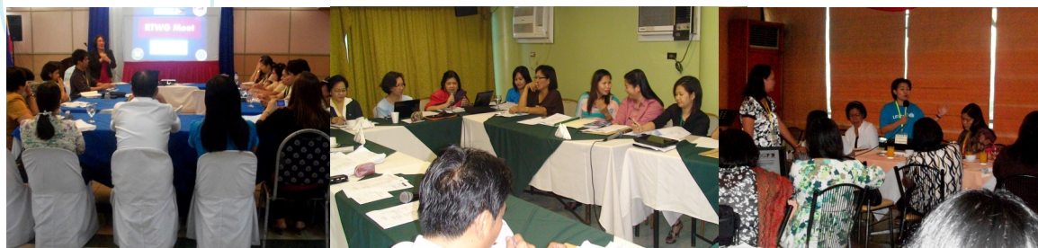
L-R: Regional Technical Working Group Meeting in Iloilo City, Naga City and Zamboanga City.

reports to the JP team visit participants, highlighting significant counterpart of local partners, while awaiting technical assistance from the Joint Programme. All areas have identified their peer counselors and are now awaiting the training module and schedule of training. Health workers are also now trained in IYCF. Challenges reported include the following: 1) delay in the dissemination of the guidelines for distributing iron folic acid supplements; 2) delay in the conduct of training for midwives on community organizing, and IYCF training for peer counselors; 3) and uncertainties in the roll-out of the COMBI initiative.