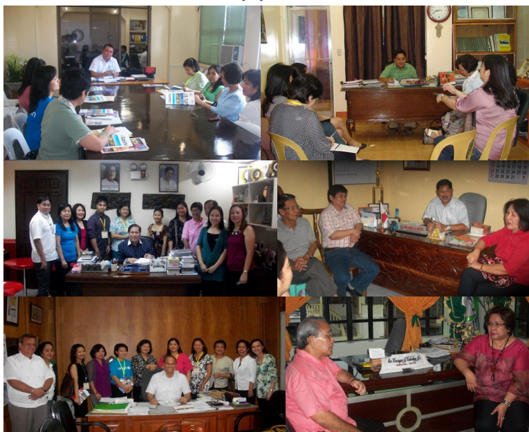
(L-R) JP team visits the LCEs of Naga City, Ragay, Camarines Sur, Iloilo City, Carles, Iloilo, Zamboanga City, and Aurora, Zamboanga del Sur.

meetings and presented updates on the various components, and provided inputs in finalizing the regional annual work plan for year 2.